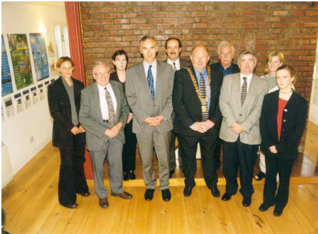
Photo of Officers with the Lord Mayor of Cork in the offices of Cork City Energy Agency.